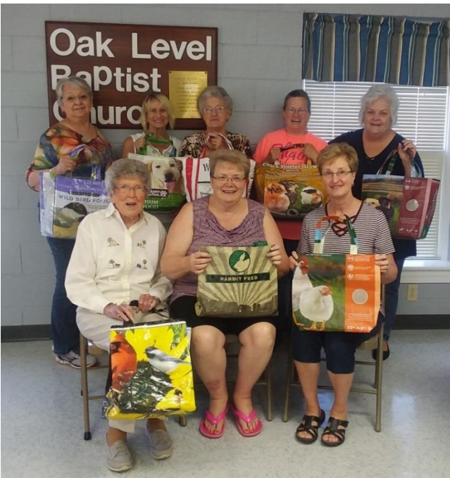
Our WMU ladies met on Saturday, May 18, and made 30 market bags for Standing Rock Indian Reservation.

A team of volunteers will be going to Standing Rock in July to minister to the Native Americans. Other items that the team will be collecting are: Athletic style shoes for boys and girls and teens; Underwear for girls and boys - girls like the pretty and bright colored panties and boys really like boxers; Socks for the children and teens - girls like the bright colored ones (no show and low cut) and boys like the dark colored ones (no show and low cut); Prizes for games (balls, match box cars, small stuffed animals) and Walmart $25 gift cards.