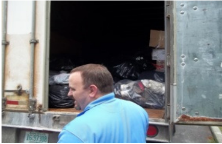
Truck Driver loading bags into Tractor Trailer