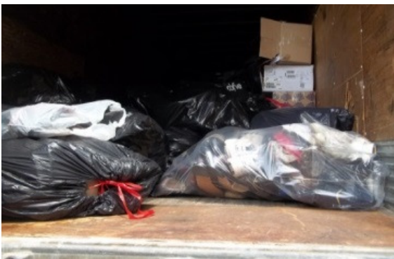
Tractor Trailer Loaded with Shoes