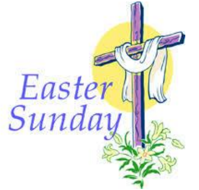
Sunday, April 4, 2021